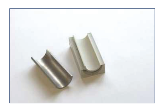
Remove Steel insert from Insert Block.