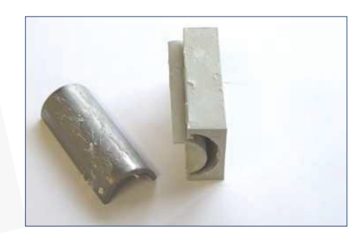
Lubricate both sides of steel insert and all internal and external faces of block including under rubber lip. Re assemble and pack as per MCT Brattberg standard packing instructions.