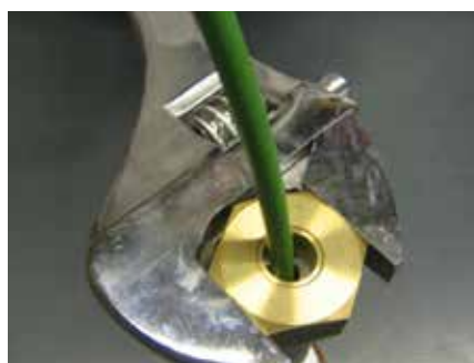
10 Push cable through assembled gland & tighten nut.