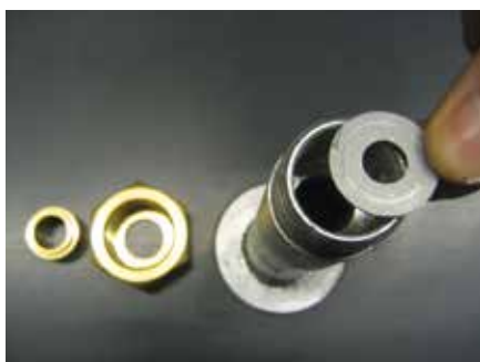
7 Fit top washer if required.