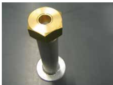
2 Top view of gland with gasket in position.