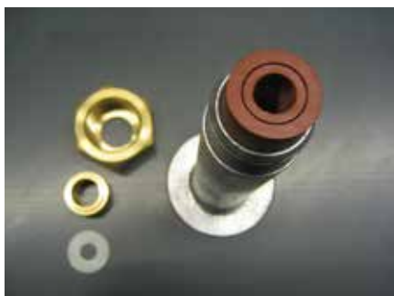
6 Push seal into place.