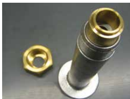
8 Fit compression spigot.