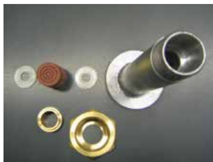
3 Remove top nut & internal parts.