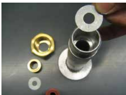
5 Size washers to cable & insert if required.