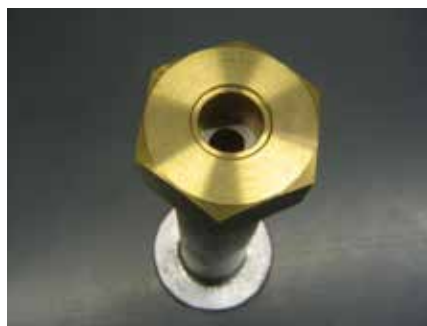
9 Locate nut on compression spigot.