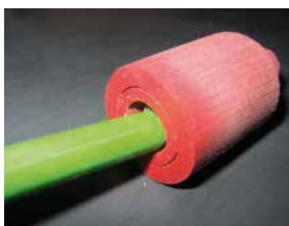
4 Remove the minimum number of rings to allow cable to pass through the seal.