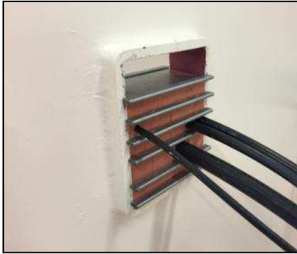
Pack the frame in accordance with MCT Brattberg packing guide. End with a stay plate.