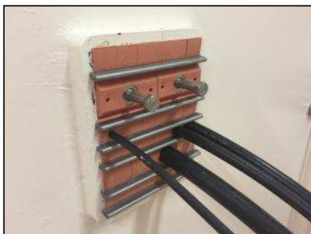
The PTG can be installed at any position within the frame.