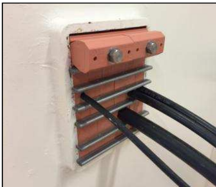
Push in the PTG into the frame. Make sure the PTG is placed inside the front and back edge of the stay plate.