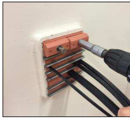
Tighten the two bolts evenly in steps.