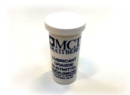
Note! All sealing surfaces on the PTG must be lubricated with MCT Brattberg Lubricant to establish a pressure tight seal.