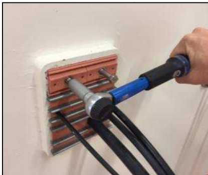
Or use a torque wrench. Maximum torque is 20 Nm.